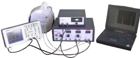
ED-COM with BER(COM): Fibre Optic Communications & Bit Error Rates

FULLY INTEGRATED PHOTONICS TEACHING LABS