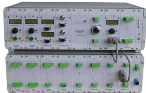
ED-WDM Series: WDM Components, WDM Systems & Bragg Gratings