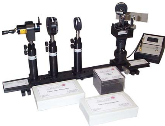
ED-WAVE: Principles of Optical Waveguiding