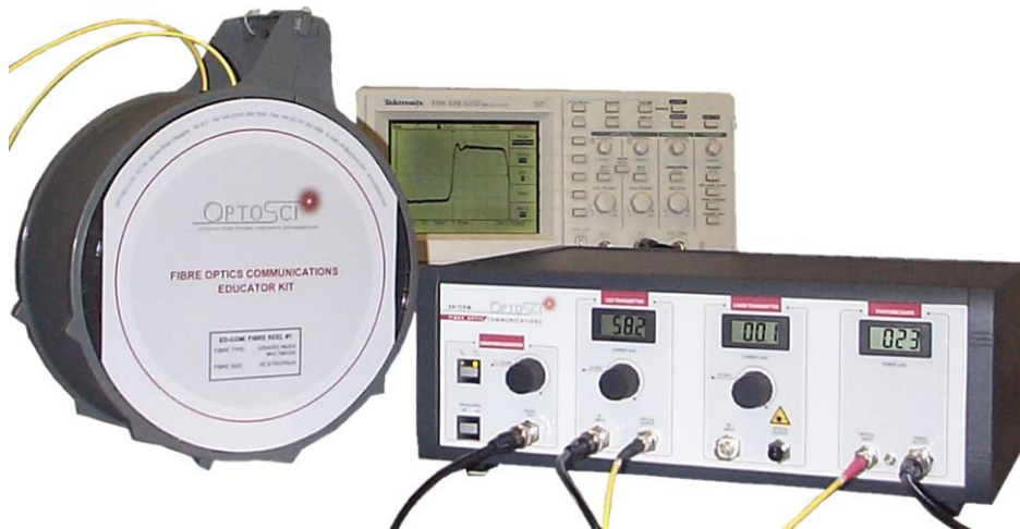
N.B. Oscilloscope not included